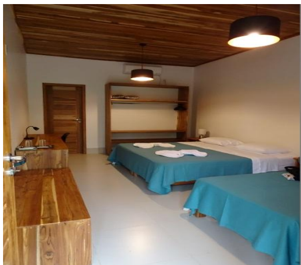
Room at SouthWild Amazon Lodge