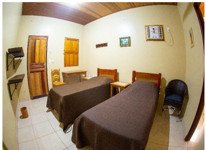
Pouso Alegre Lodge