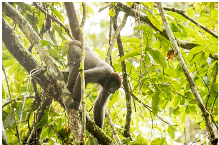
Gray Woolly Monkey

With the flexible itinerary we will attempt to find the special and endangered primates in the area and try to photograph them. Gray Woolly Monkey ( Lagothrix cana ) and the White-nosed Saki ( Chiropotes albinasus ) are two of the star species here. These two species, both sadly listed as endangered by the IUCN, are endemic to the central-southern Amazon. Thankfully their population is healthy here and the guides keep