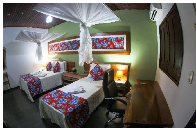
SouthWild Pantanal Lodge Room